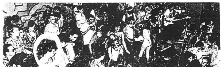
It takes a village: East Village Orchestra, Palladium